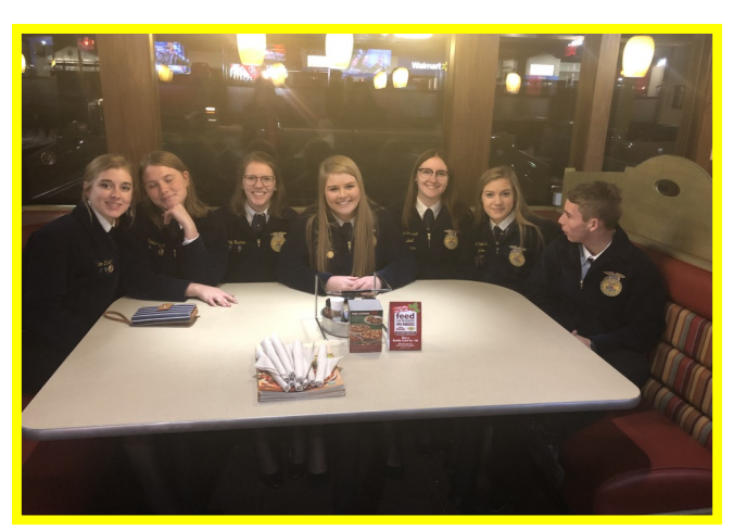
The advanced Parliamentary Procedure team enjoying Larosas after the district contest!